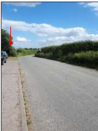
From Ightfield looking to entrance (red)

7.4 Photos below show that either end of the path there is access onto sufficiently wide pedestrian pavements.