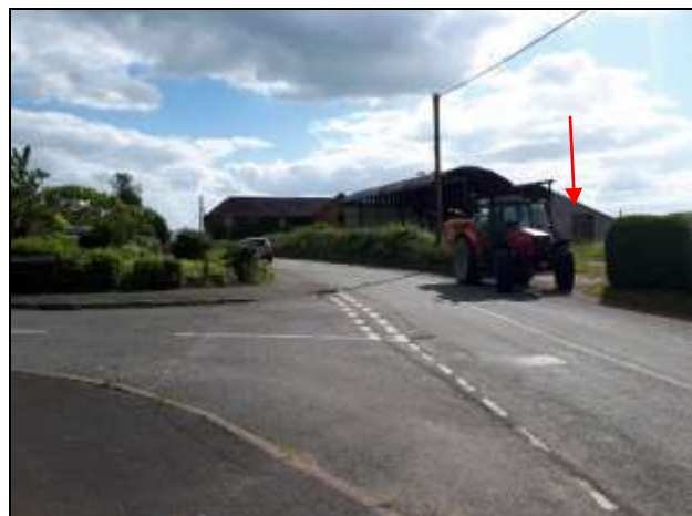
At Calverhall, cross road at access to reach pavement

7.5 Where there is existing field access from Calverhall Road, it is proposed to fit double galvanised gates (one either side of the path) which means that tenant farmers can access the fields and temporarily cross the path, this will afford safety to users of the path and the farmers accessing their fields with tractors and livestock. Please note there will be three field accesses along the length of the path, example below;